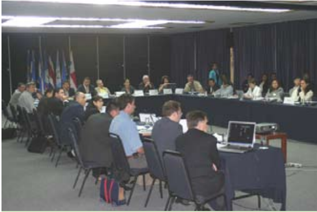
Third Meeting of Policy Directors and Technical Secretaries